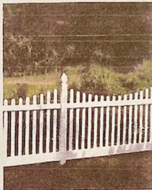
4' SCALLOPED VINYL