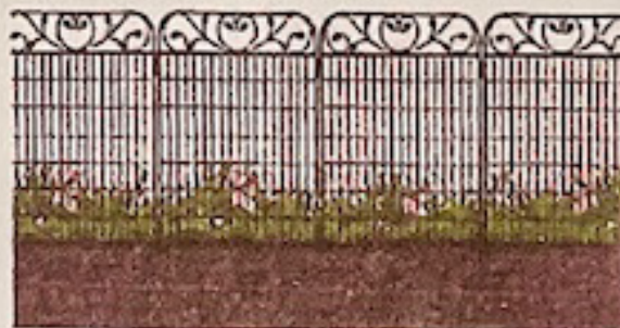
4' LANDSCAPING FENCING