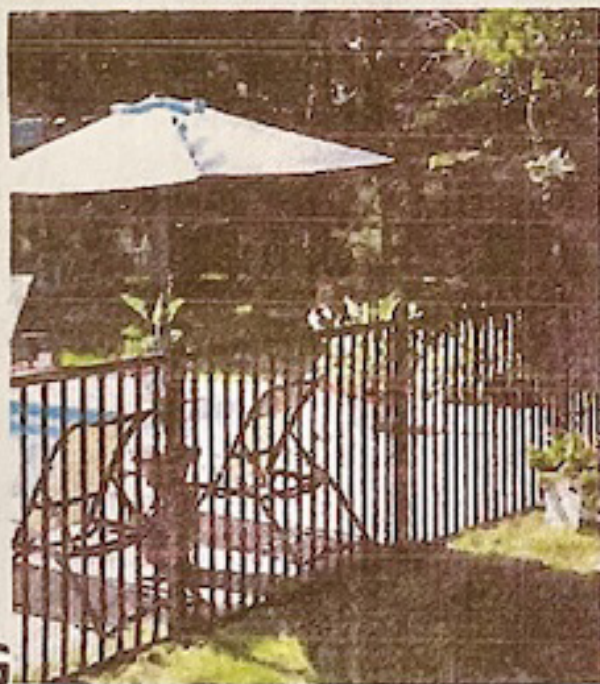
4' ALUMINUM STRAIGHT