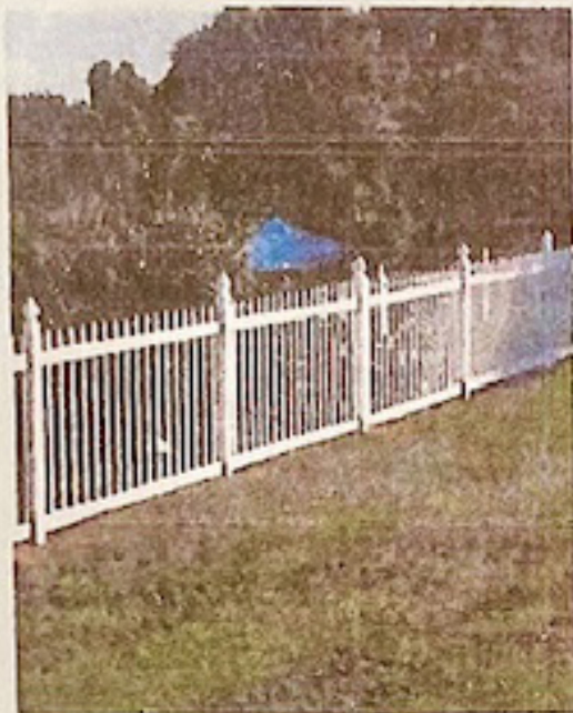
4' STRAIGHT VINYL